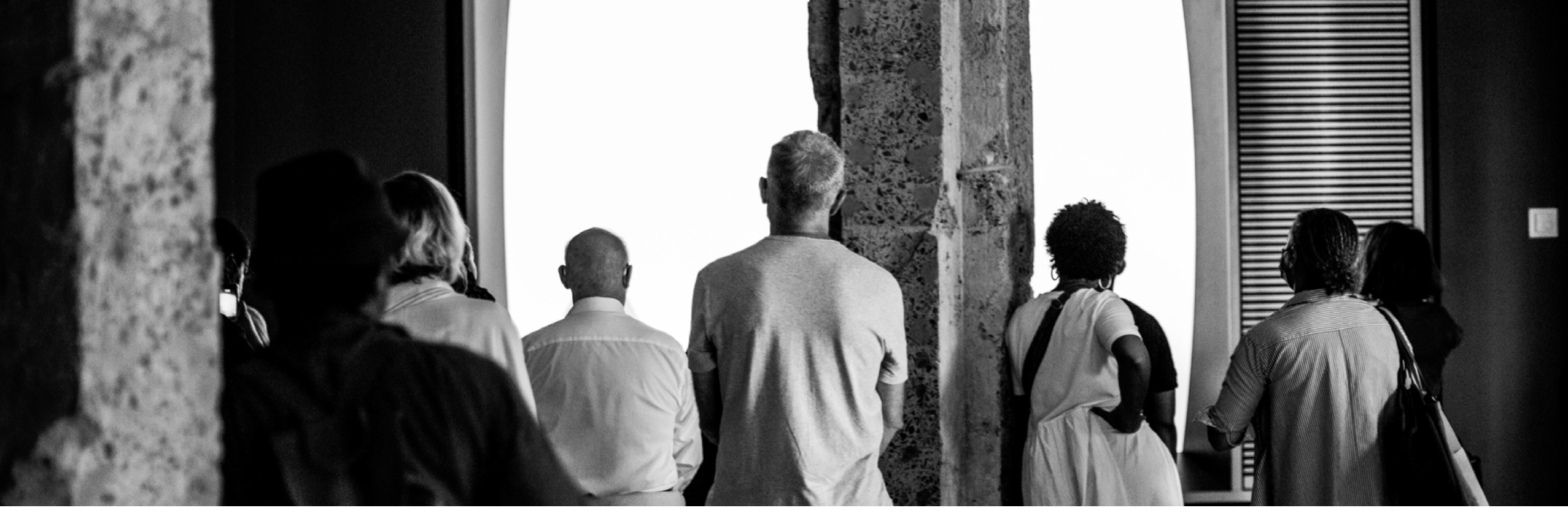
Exhibition view: Tracey Rose, Shooting Down Babylon, 2022.