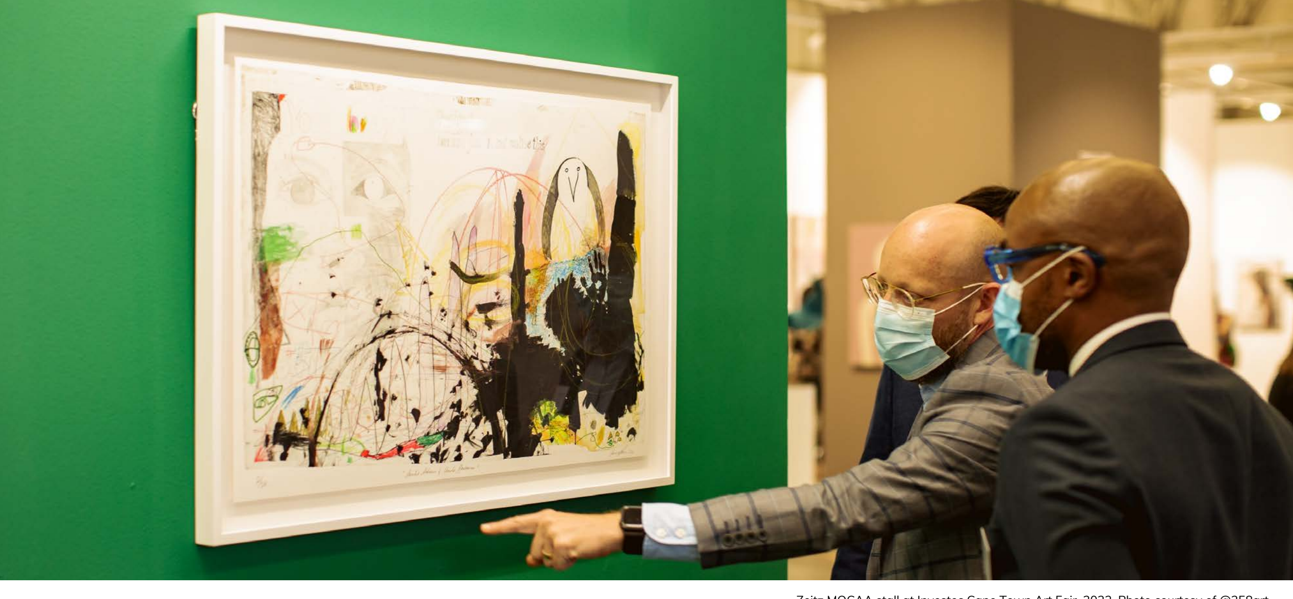
Zeitz MOCAA stall at Investec Cape Town Art Fair, 2022.

Connect with us today to talk about the various corporate membership opportunities we have available.