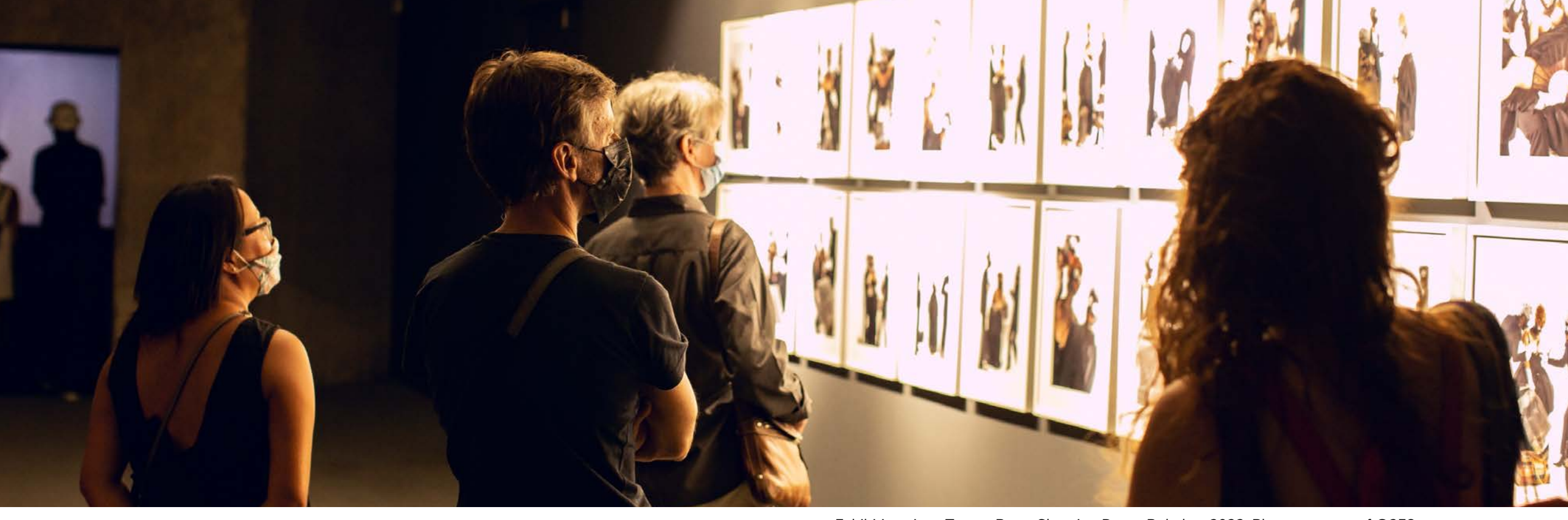
Exhibition view: Tracey Rose, Shooting Down Babylon, 2022.